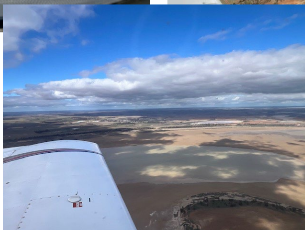
(Right) coming into Lake Grace