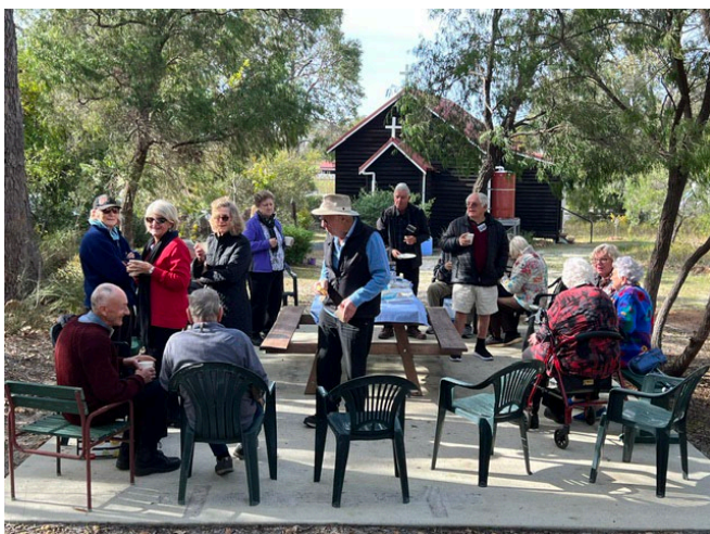
(Left) Pentecost at Metricup last Sunday with morning tea afterwards