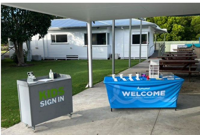
(Left) The Kids Sign-In and the Welcome desks for Sunday services at Living Water